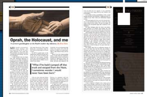
HALF PAGE VERTICAL