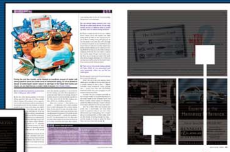
HALF PAGE HORIZONTAL